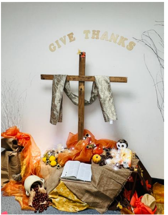
The prayer room at Holy Cross Catholic Primary School

10<sup>th</sup> January Epiphany Mass for pupils.